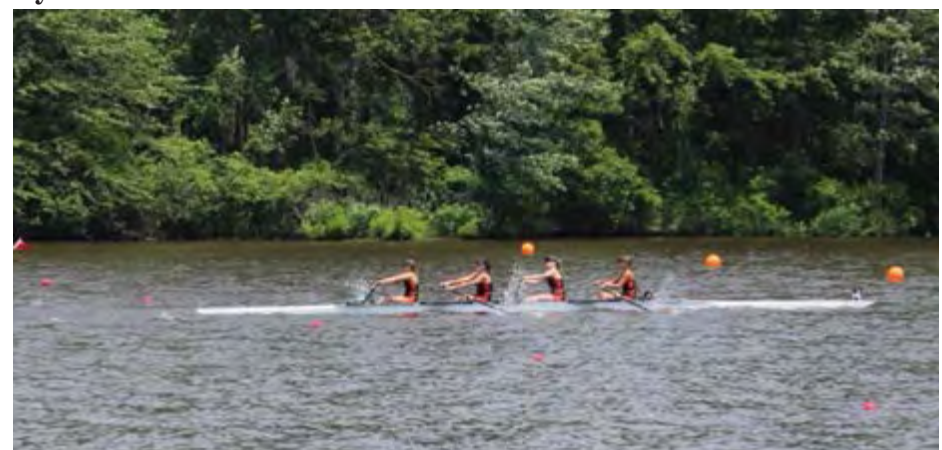
Oakland Strokes Women's Varsity 4+ Boat wins a Gold Medal by Open Water at the 2017 U.S. Rowing Nationals on June 11 at Mercer Lake, West Windsor, NJ.

three Oakland Strokes boats that medaled at the US Rowing Youth National Championships. All of them were powered – at least in part – by Lamorinda rowers.